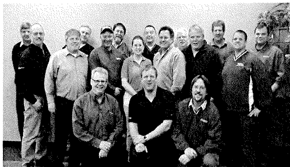
StenerSON Sales Staff 3/31/11

Usually we use this section of our newsletter to spotlight a specific StenerSON Lumber employee. However, this month, we recognize our entire sales staff and the effort they've put into keeping current and continuing their education. Choosing classes we feel are relevant to serving you better, many of our team members have taken sales curriculum and computer training. We also have taken many specialty courses such as pole-barn/ag-building programs, decking guidelines, lead-based paint certification, green building, braced wall workshops, home-warranty law, geothermal heat courses, building code classes, and safety training. We've also spent a lot of time with our vendors, soaking up new product knowledge and taking plant tours. These tours can be quite informative when recommending upgrades such as pre-finishing. This spring, we will be working on becoming a Certified Green Dealer. Our salesmen will be taking a series of classes to gain a better understanding of green products and their place in "good building." We will be better able to promote the green products we already carry and perhaps even add a few more of them so you are more able to market to your clients that are concerned about building green. Our hope is, with keeping up with our homework, we are able to continue providing you with quality products and the knowledge to back that up.